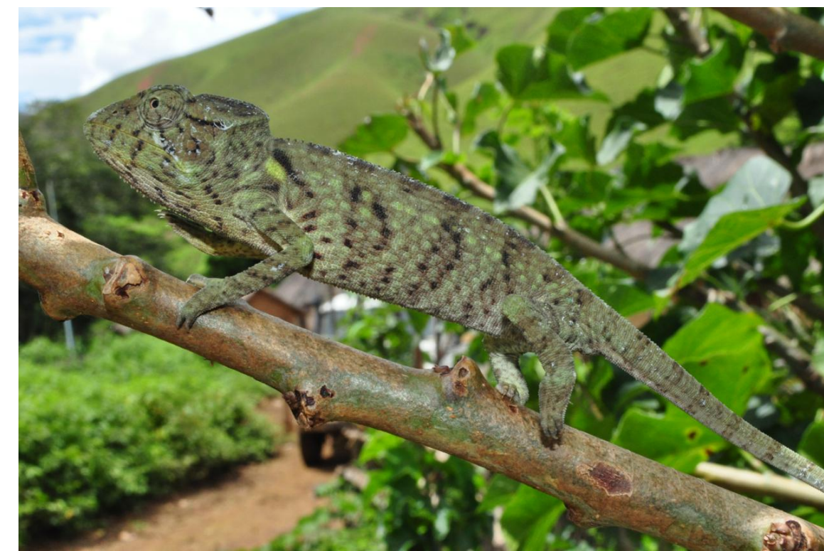
Furcifer oustaleti (female)