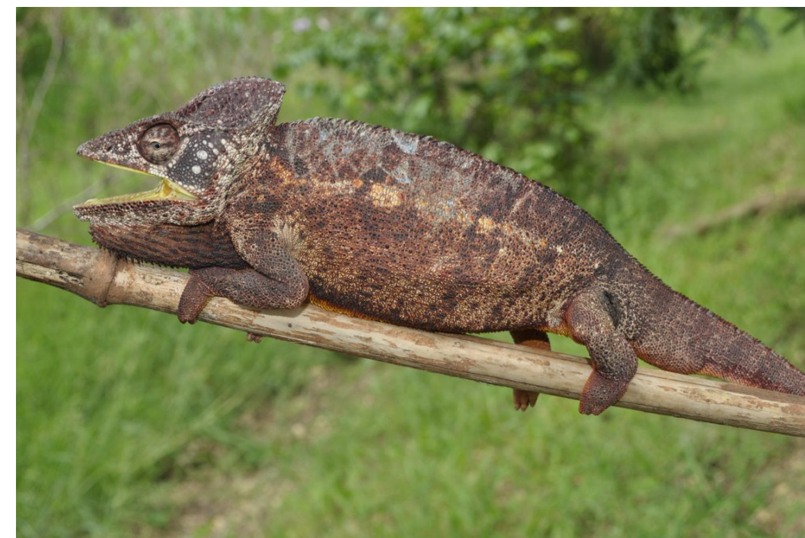
Furcifer oustaleti (male)

The Malagasy Giant Chameleon ( Furcifer oustaleti ) is a CITES protected species indigenous to Madagascar. It has been introduced to South Florida where it has established a population, and could potentially be an invasive species, but this has never been before studied. The purpose of this experiment is to pinpoint where these Florida chameleons originated from in Madagascar. We accomplished this by creating locality-specific mitochondrial barcodes for F. oustaleti in their native range. We then compared the mitochondrial DNA of Florida chameleons to the mitochondrial barcodes of the Madagascar chameleons. We were unable to pinpoint one exact location that they could be coming from, but all 9 matching localities were in southern Madagascar. Knowing where the chameleons come from is the first step to helping prevent them from harming any environment which they are being introduced to through the pet trade.