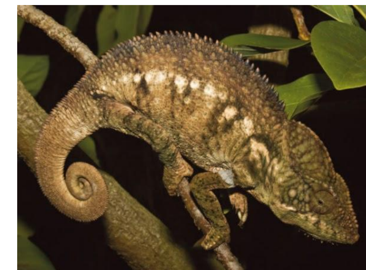
Furcifer oustaleti found roosting in an avocado grove in Southern Florida (source: Gillette et al., 2010)